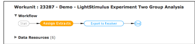
Figure 10: Assign Extracts Workflow

workflow. In data import workflow, for instance, the user must assign extracts to the imported files. The workflow-driven approach of B-Fabric is very useful in practice to reduce human mistakes and avoid skipping steps.